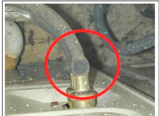
Fig. 1. Standard rubber washing machine hose about to burst.

Most traditional washing machine hoses are made of reinforced rubber or polymer. (Fig. 1) These materials lose resiliency as they age, making them subject to cracks, leaks, and bursting. The IBHS study showed that failure rates increase dramatically in hoses that are more than five years old; the average age of failed hoses was 8.7 years. More than half of all failures occurred by the time the machine and its hoses were eight years old, and nearly 80% occurred before ten years.