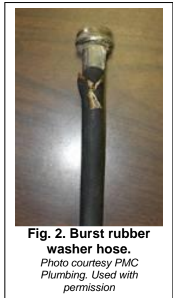
Fig. 2. Burst rubber washer hose.

Braided stainless steel hoses (sometimes called “steel-clad” hoses) were designed as a reliable replacement for standard black hoses, but they, too, have been problematic. They have proven to be not much stronger than standard rubber hoses, and they are also subject to failures related to the materials from which they are fabricated.